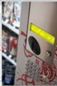
DURABLE STAINLESS STEEL KEYPAD