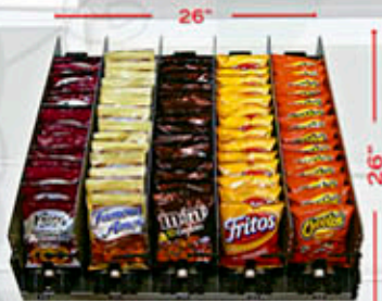
TOTAL = 70 PRODUCTS