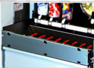
PRODUCT SENSOR DETECTION GUARANTEES THE PRODUCT VEND